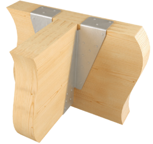
Typical HBPH installation